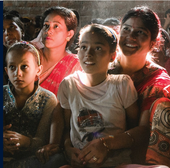
Alice Smeets © Legatum Limited, 2018

Modern slavery entraps men, women and children forced to work long days in dangerous and punishing conditions – to make bricks, peel prawns, mine tin and gold, pick cotton and weave carpets. Victims of modern slavery have their freedom denied. They are used, controlled and exploited by another person for commercial or personal gain.